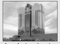
In order to gain extra revenue for itself, Albany created a tax-free nation (Seneca) in the heart of Niagara Falls to compete directly against tax-paying Americans. Is it a coincidence? This giant new Seneca hotel pays no property, income, sales or bed taxes. Meanwhile, four heavily-taxed American hotels, within its shadow, have closed since it opened.

a conference center, a bistro, a coffee shop, a nightclub, numerous souvenir and gift shops, and a 26-story, 604-room hotel.