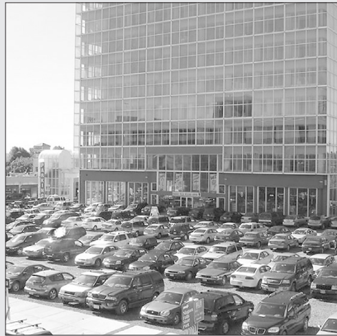
THE PLACE OF THE PUBLIC MEETING: ONE NIAGARA, 360 RAINBOW BLVD., CORNER OF NIAGARA ST.